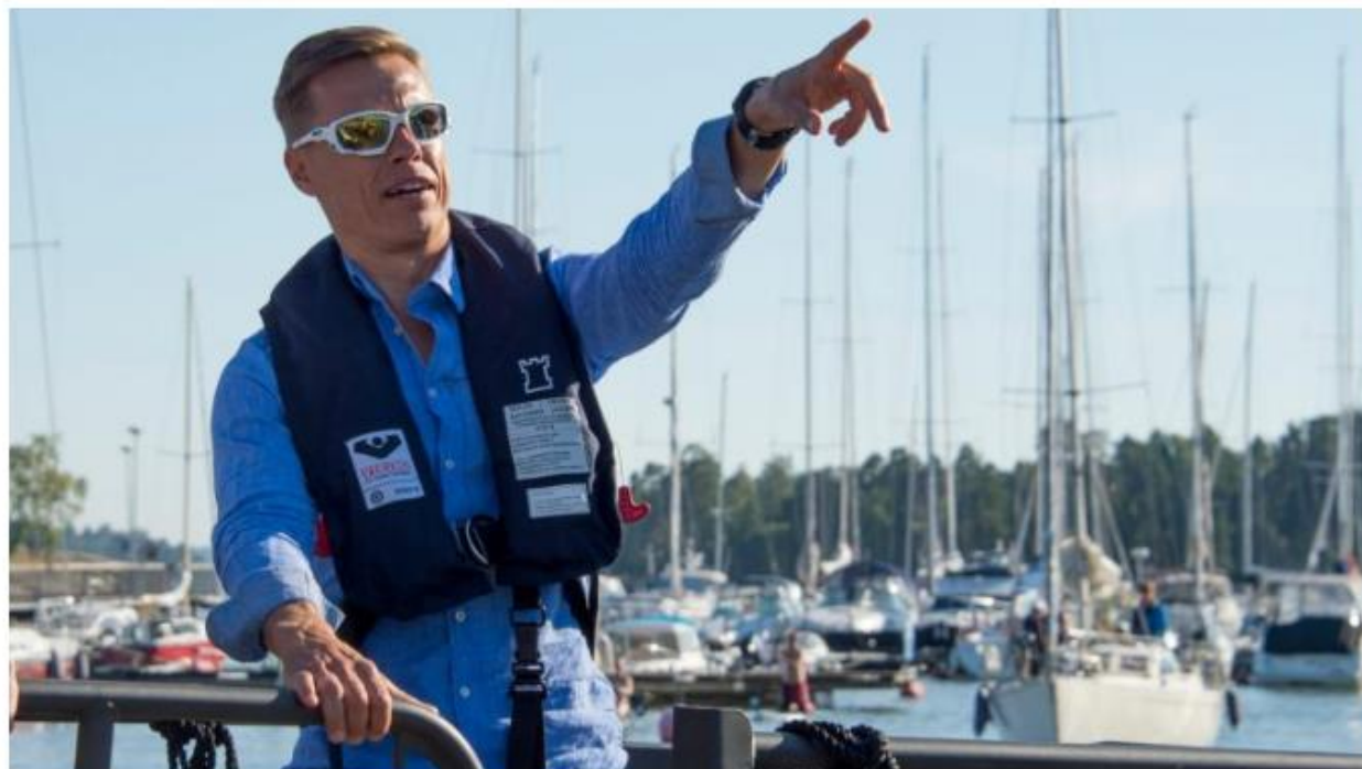
Alexander Stubb, then Finnish Finance Minister, leaving for a cruise in the Espoo archipelago in a navy patrolboat, Finland, 23 August 2015.